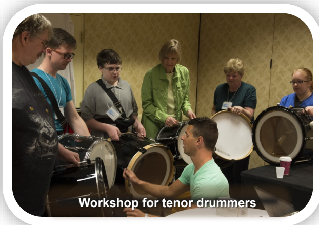
Workshop for tenor drummers

Visit us on the web: http://AtlantaPipingFoundation.com