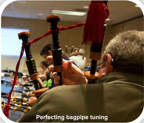
Perfecting bagpipe tuning